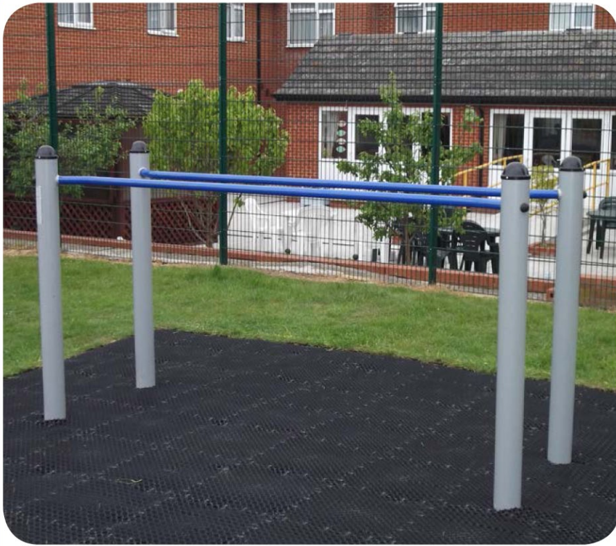
Unit Dimensions (mm) LxWxH : 2669x837x1557