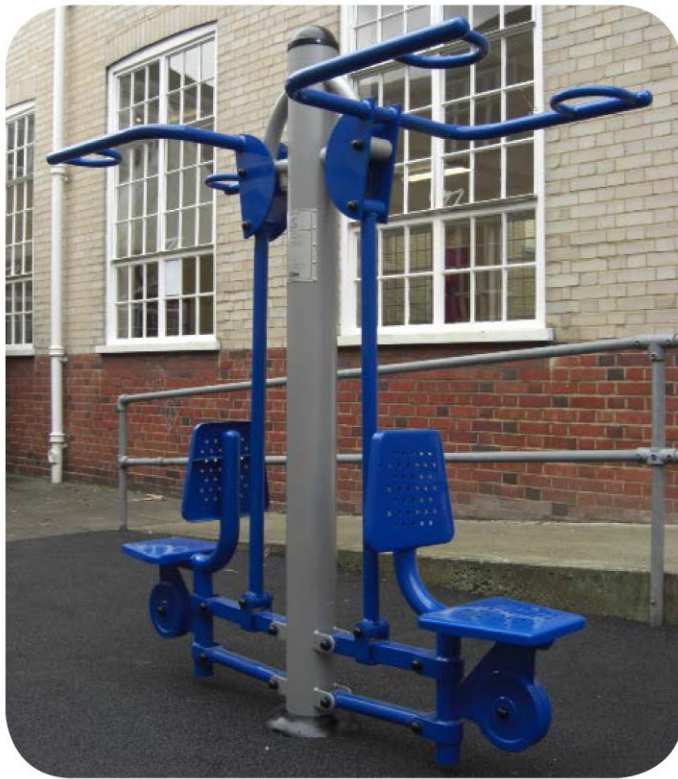
Unit Dimensions (mm) LxWxH : 2354x700x1951