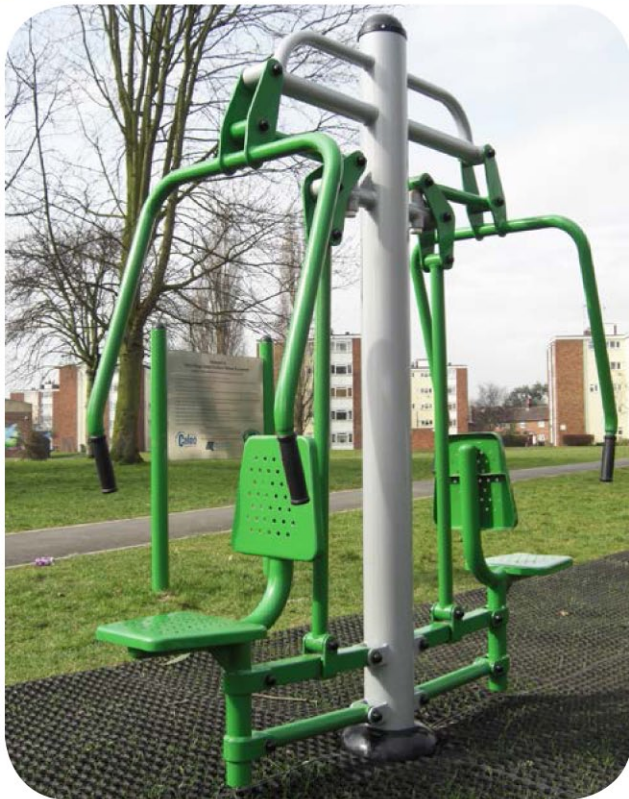
Unit Dimensions (mm) LxWxH : 2060x682x1951