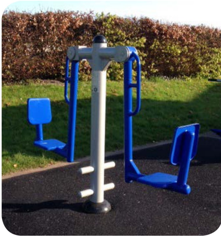
Unit Dimensions (mm) LxWxH : 2080 x 460 x 1670